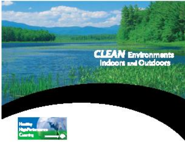
Communications Program Manual

Create posters, newsletters, media releases & step-by-step marketing ideas.